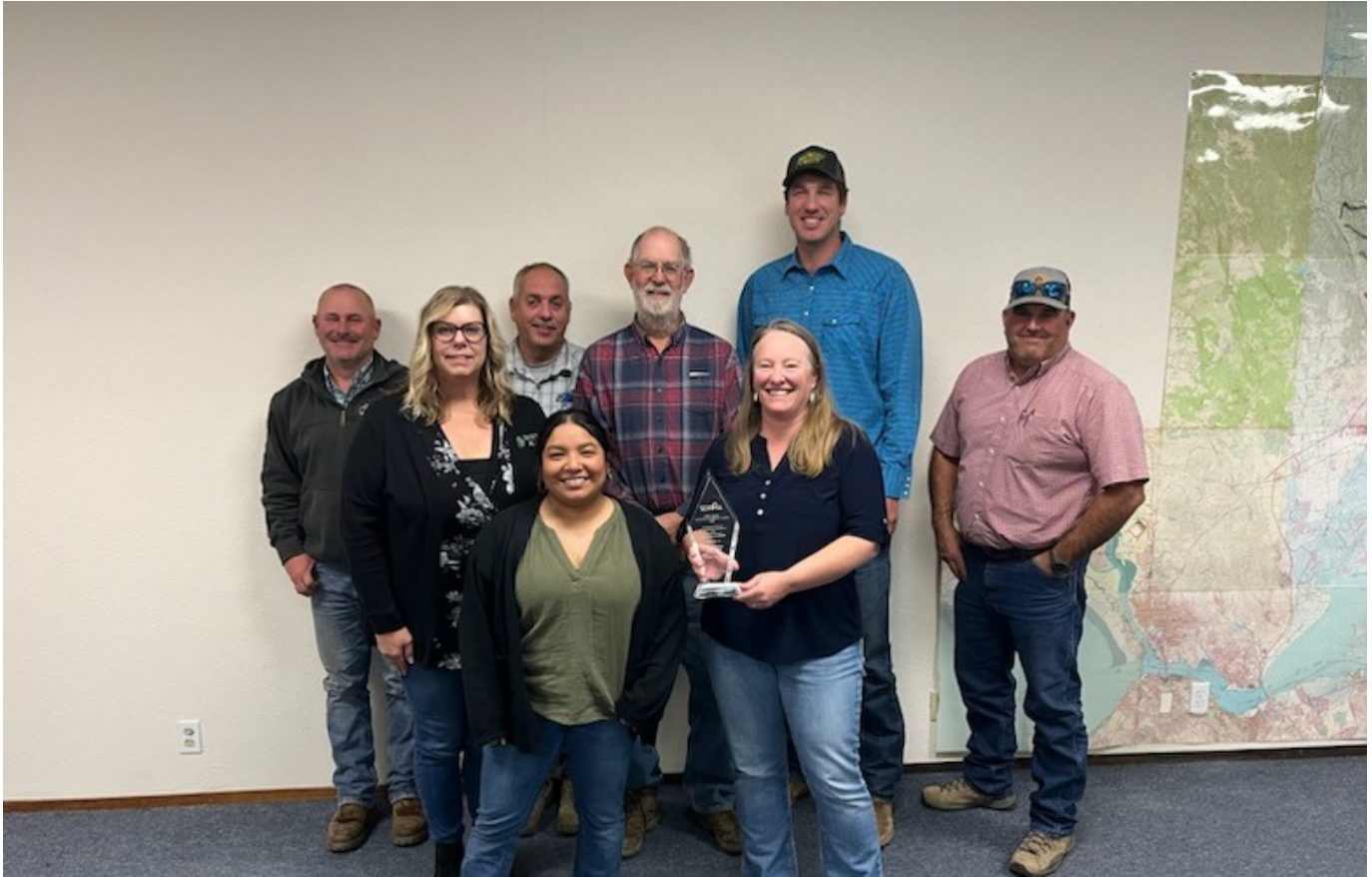
Dixon RCD board & staff with 2023 CSDA Safety Award