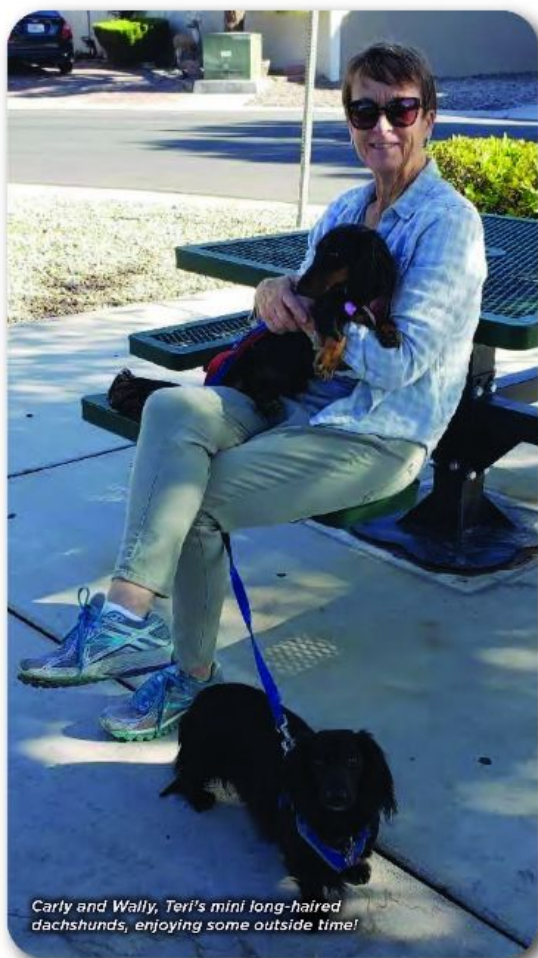
Carly and Wally, Teri's mini long-haired dachshunds, enjoying some outside time!