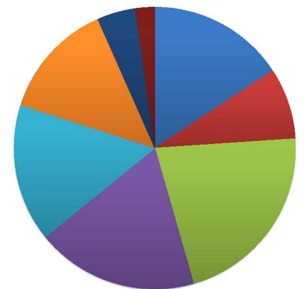
Dixon RCD 2020-2021 Drainage Costs

Fiscal Year 2021-22 The '21 -'22 Budget anticipates a negative net position of $34,580, primarily due to increased ditch capital expenditures and increased costs for ditch maintenance activities. Overall, the District's financial position is sound. The Board continues to monitor revenues and expenses to ensure the overall plans and objectives set forward in the 2016 Ditch Maintenance Fee Rate Study are achieved. The Board expects that during the next five (5) year planning period, expenditures will at times exceed revenues. However, the Board has dedicated reserves sufficient to cover the anticipated fluctuations.