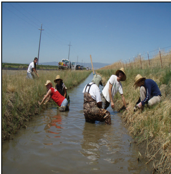
Planting native grasses on ditch bank (Casey Rd. ~Silveyville/Joy Lateral)