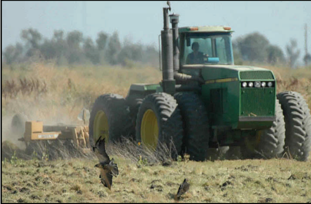
"Swainson's Hawks working with the tractor"