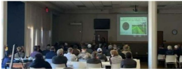
Groundwater Workshop 2023