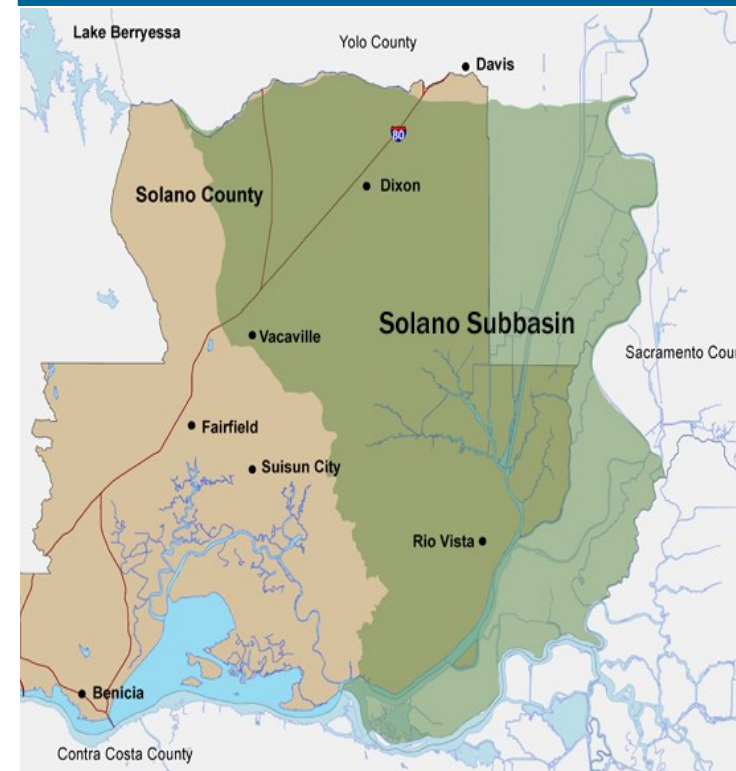
Solano Sub-Basin Map

Completion rate for all required reporting in 2015-2016 was at 99%, however over 20% submitted their reports late. Reminders are expensive and late submittals make reporting to the Regional Board difficult. ☺