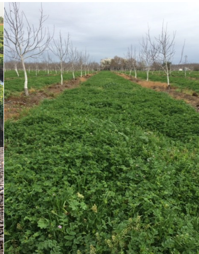
Orchard Cover Crops