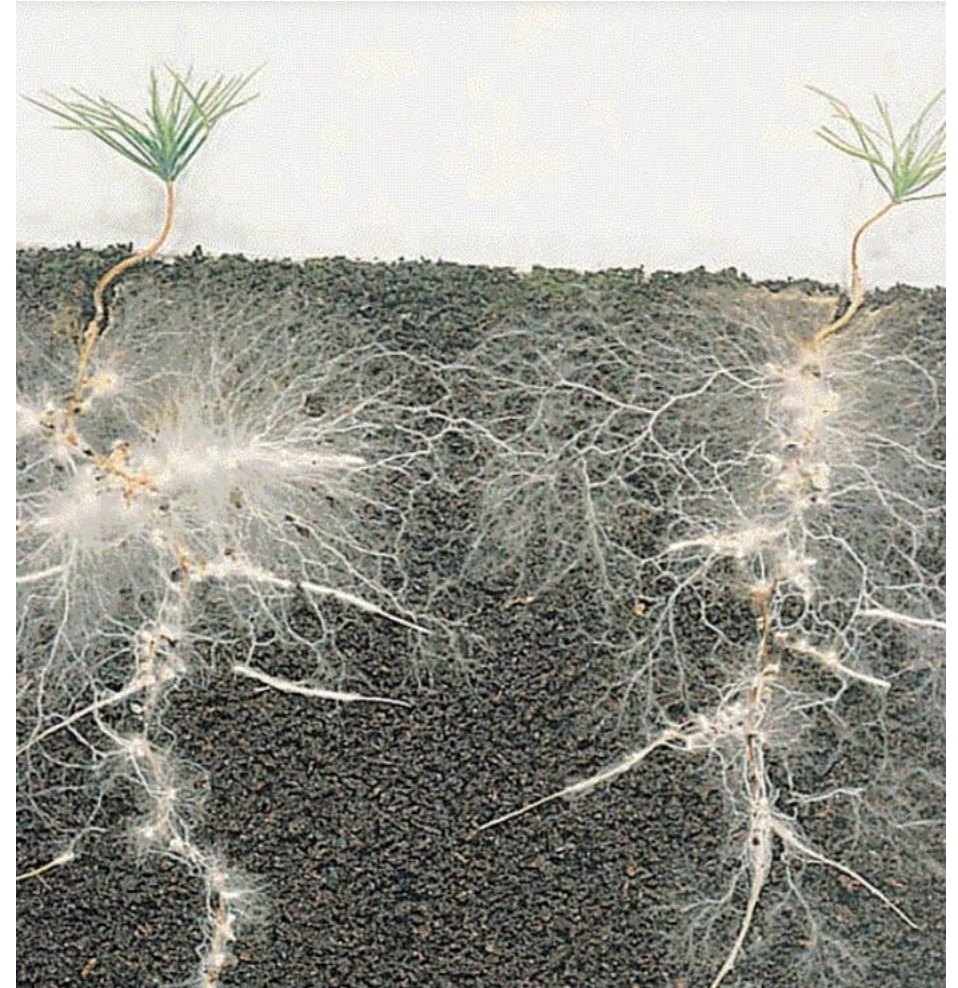
Nature (1997) 388: 517-518

Vegetation offers a relatively low-cost way to keep storm water where it lands, attenuate downstream flooding, and recharge local aquifers