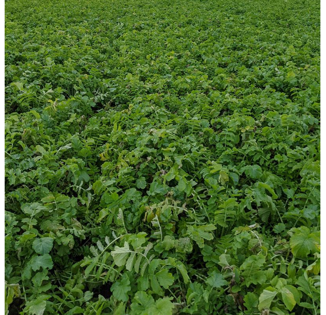
LeBallister Seed Co.